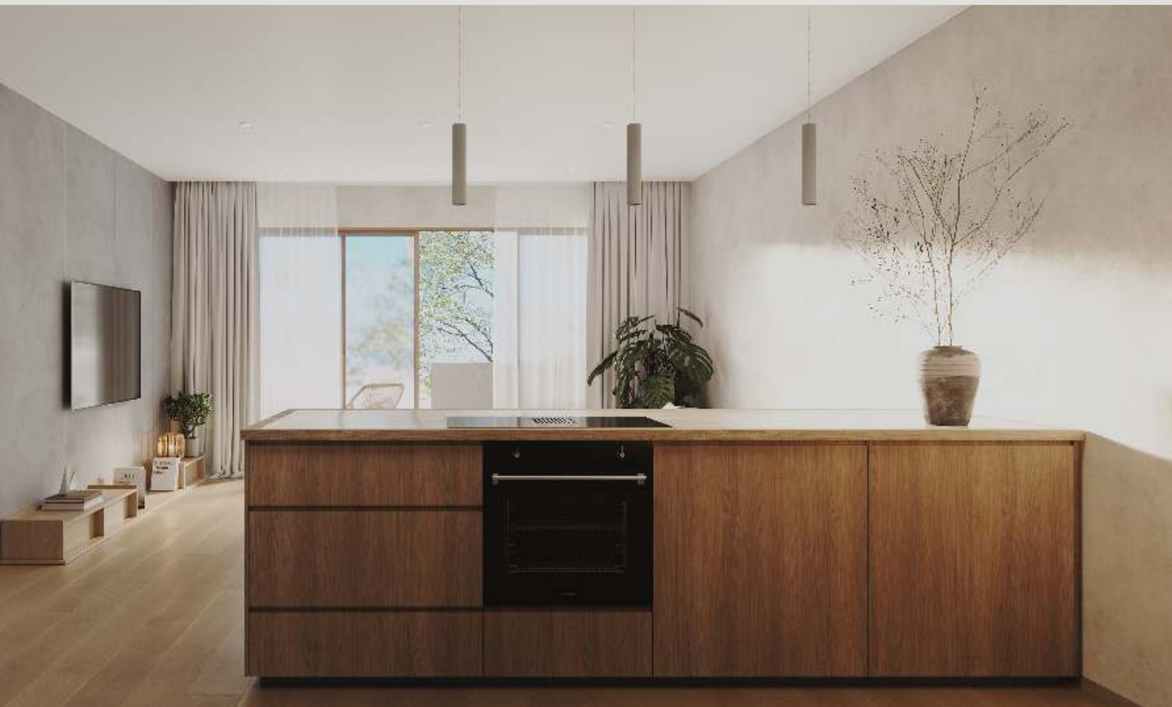
Kitchen and lounge area