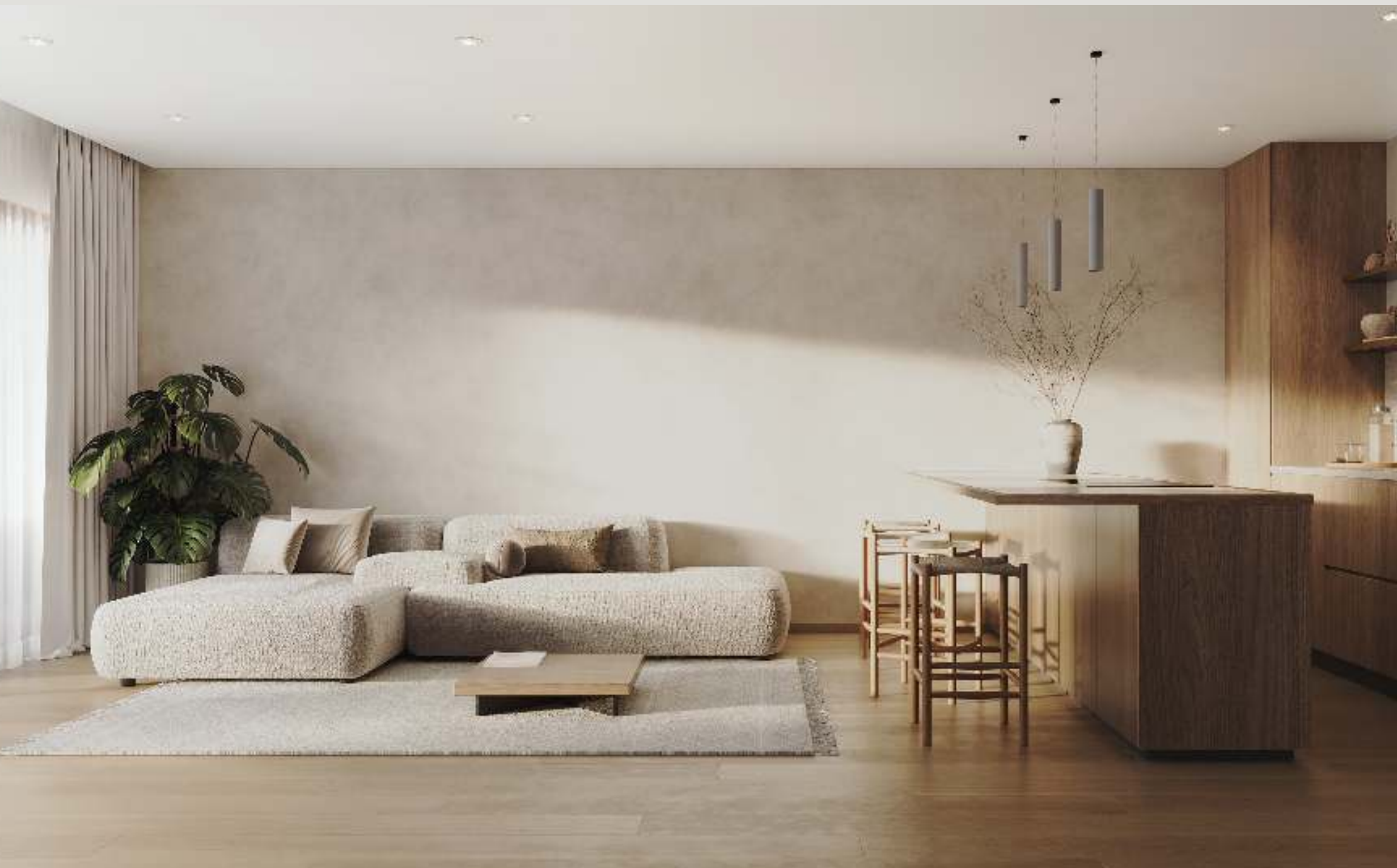
Open plan kitchen and lounge area