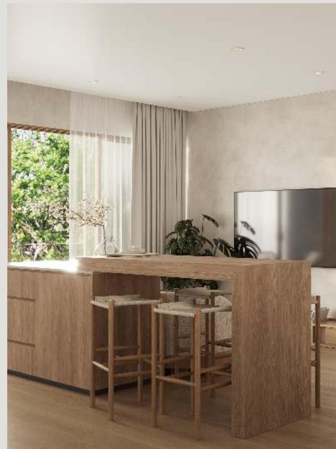
Kitchen and lounge area