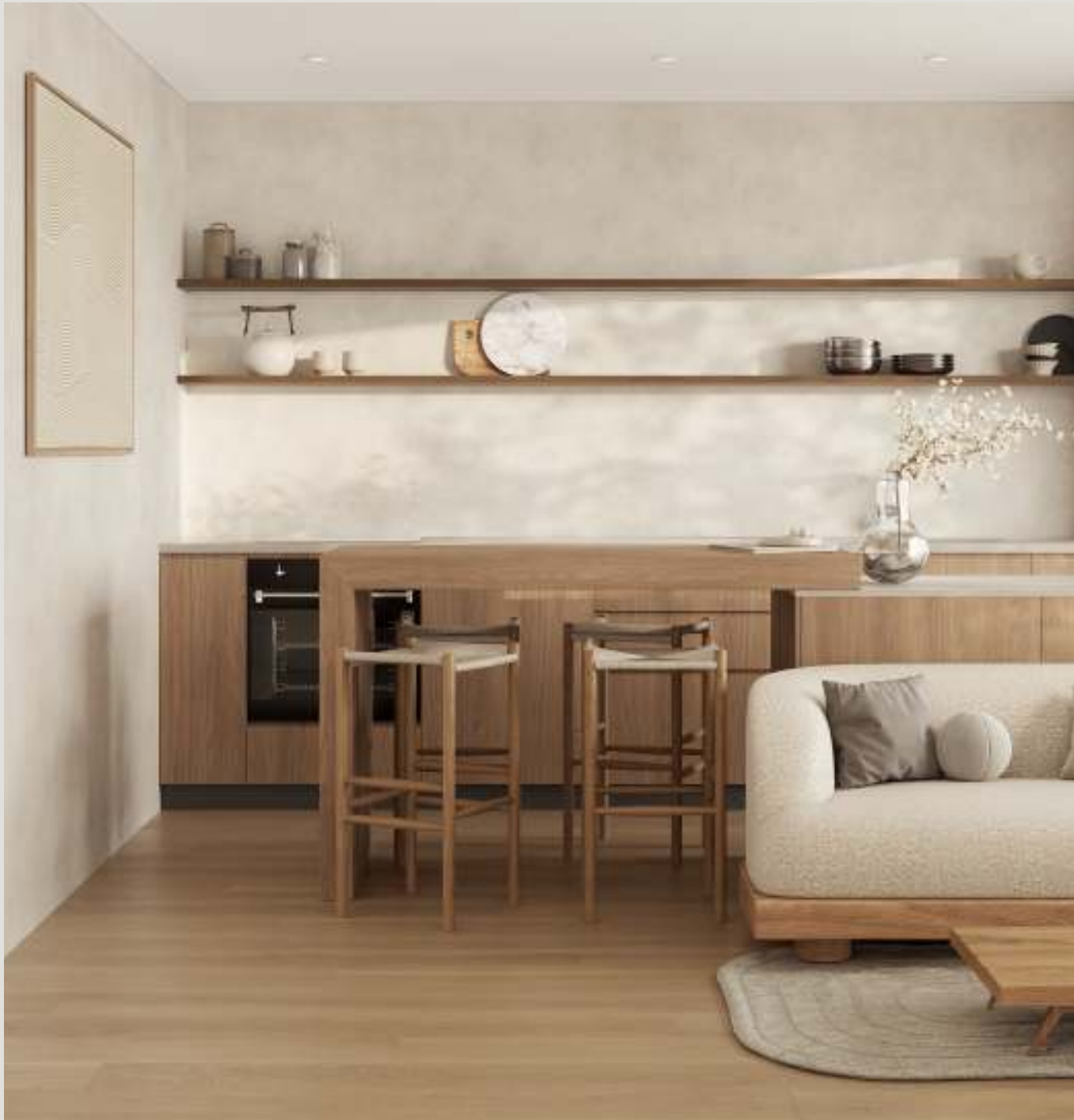
Kitchen and lounge area