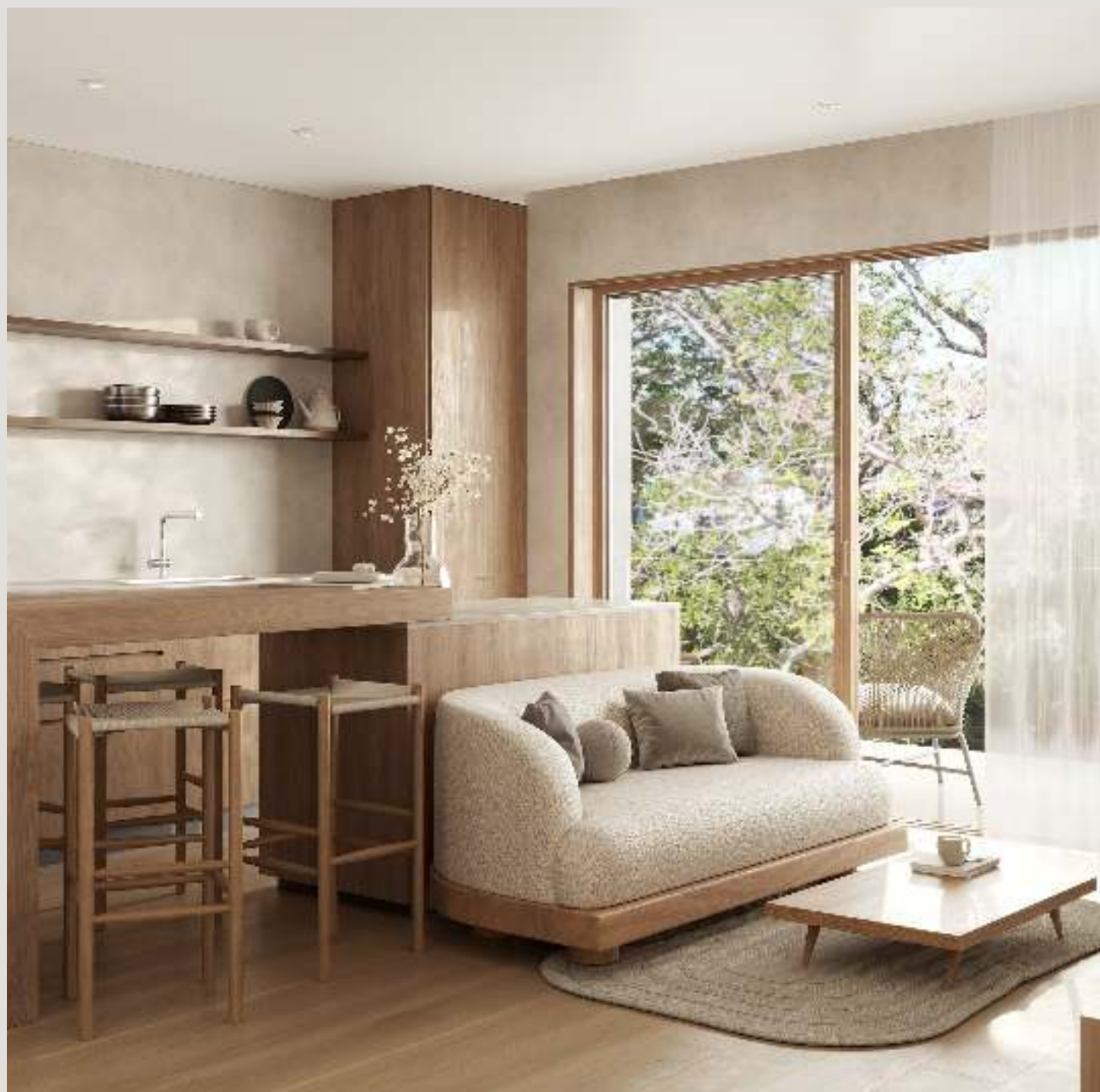
Open plan kitchen and lounge area