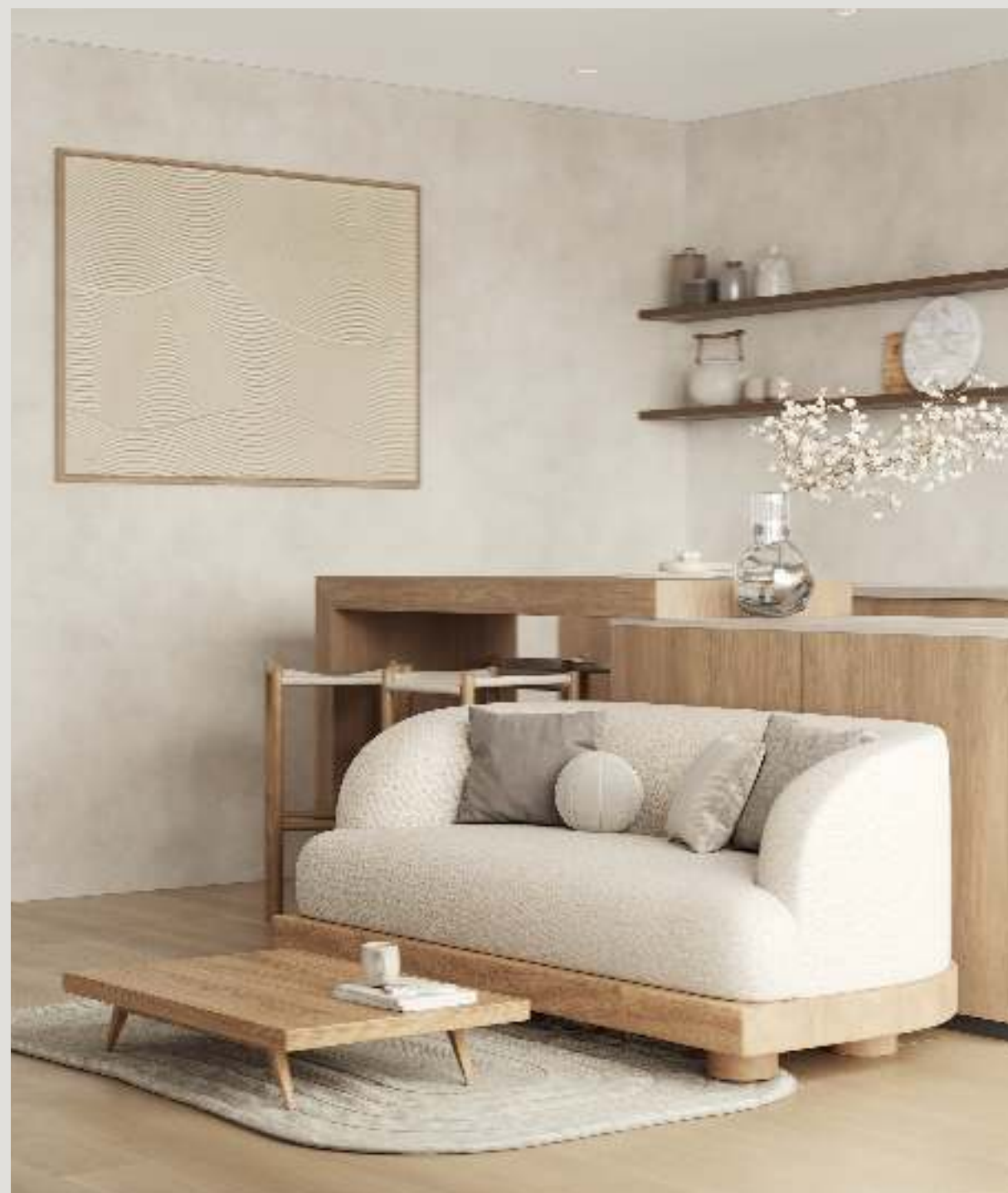
Kitchen and lounge area